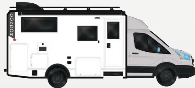
Graphics Delete Option